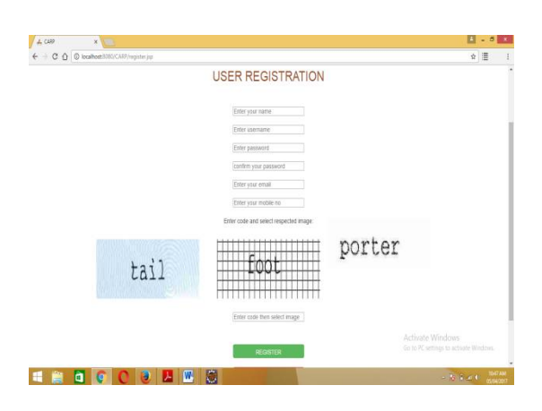
Fig2. User Registration