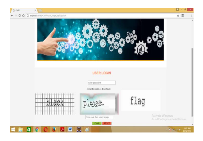
Fig4. User Sign in (B)