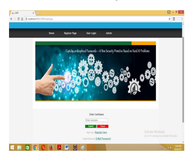
Fig3. User Sign in(A)